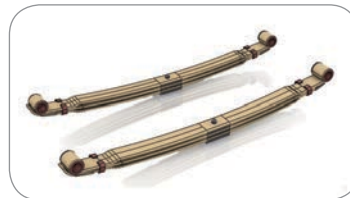
India's 1st LCV with front parabolic suspension for superior ride comfort