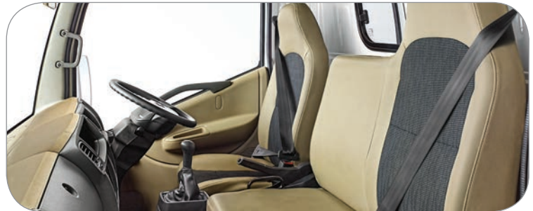
Modern, safe & ergonomic Euro Cabin with tiltable power steering