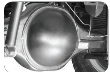
Heavy-Duty Banjo Type Axle