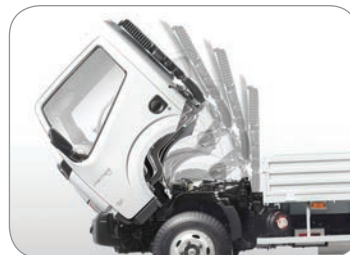
Easy to tilt cabin