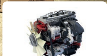
Advanced 3L ZD30 DDTi Common Rail Diesel Engine